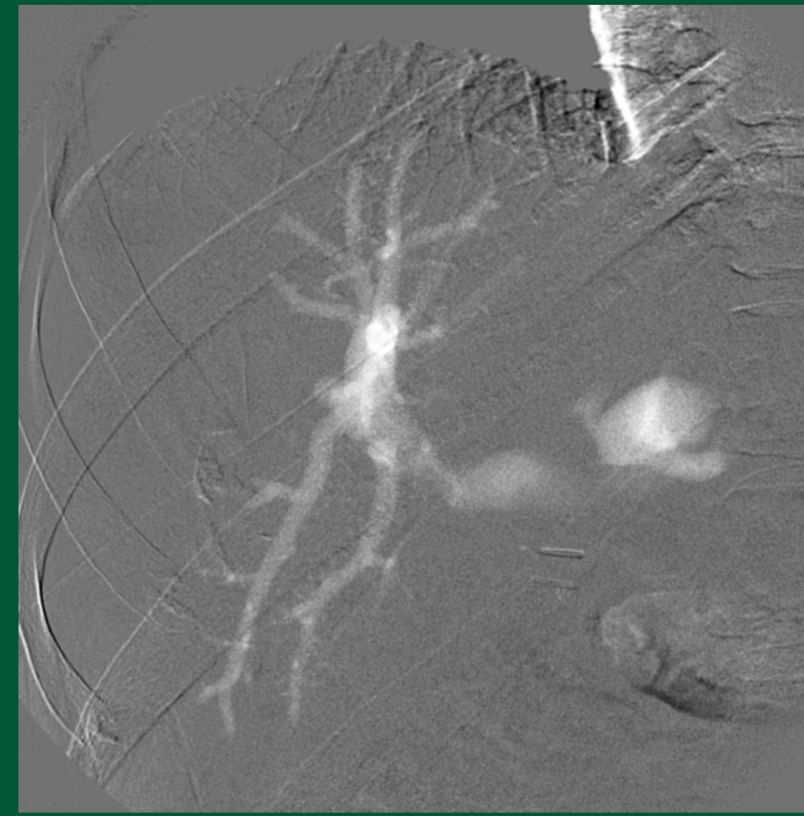
Figure 1: Transhepatic CO2 injection of 20cc's through a 25 ga needle, ascites and elevated INR present and not corrected. Image demonstrates patent portal venous system.