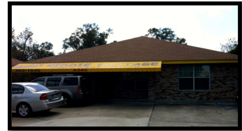
Sheila's Kiddie Cottage

created using federal one-time funds, one in Livingston Parish and one in Ouachita Parish. In addition, through facilitation by BrightStart, the Recovery School District in Orleans Parish