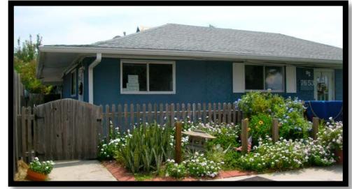
Gilda's PreSchool Academy

In the current 2012-13 school year, diverse delivery has expanded to 8 sites serving 160 children.