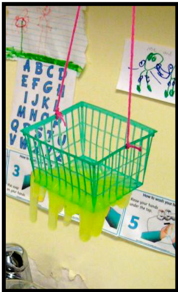
Slime experiment about weight and speed of gravity. Wilcox Academy of Early Learning.