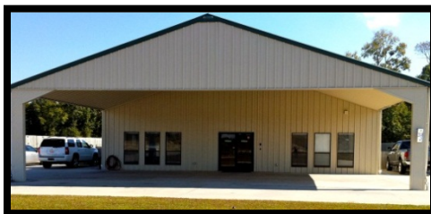
Fundamentals Early Learning Center

As hoped, these four diverse delivery pilot classrooms served as examples of the potential for success of this model and the many benefits of expanding LA 4 to community settings. Hence, in