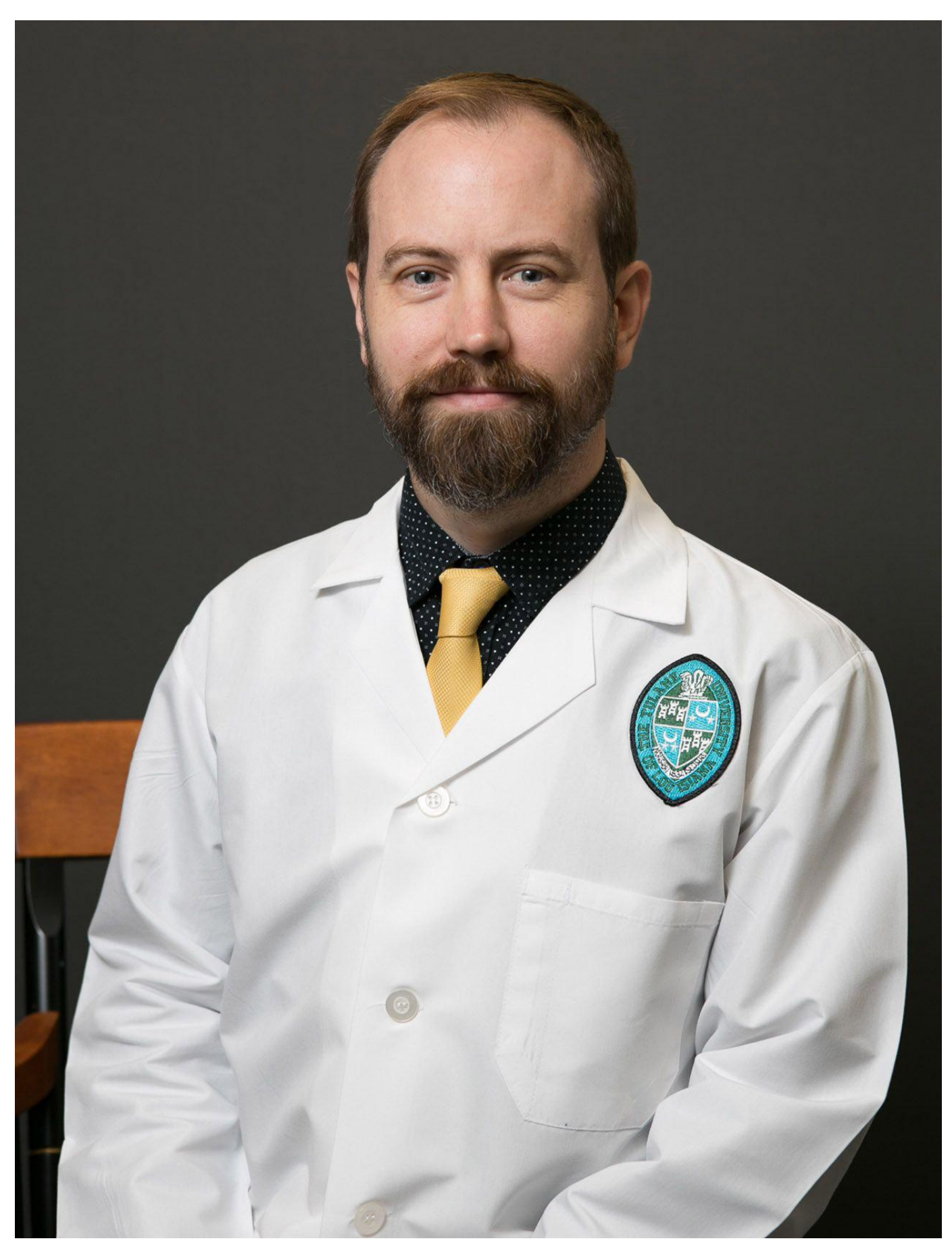
A great start to a very bright future