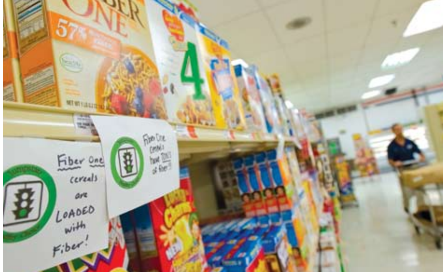
Signs give the green light to healthy grocery items.