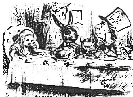
A dysfunctional group: a dominant character may make it difficult for other students to be heard