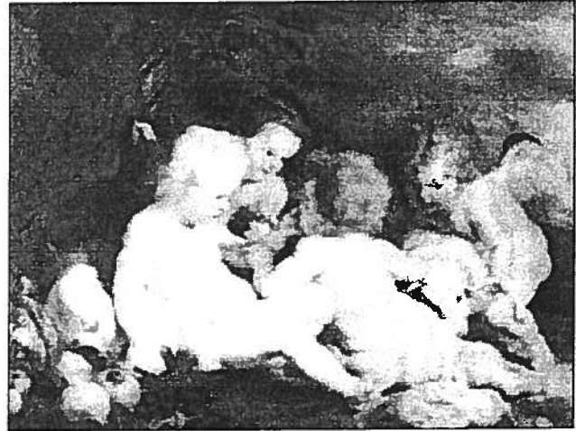
The group learning process: acquiring desirable learning skills

Students elect a chair for each PBL scenario and a "scribe" to record the discussion. The roles are rotated for each scenario. Suitable flip charts or a whiteboard should be used for